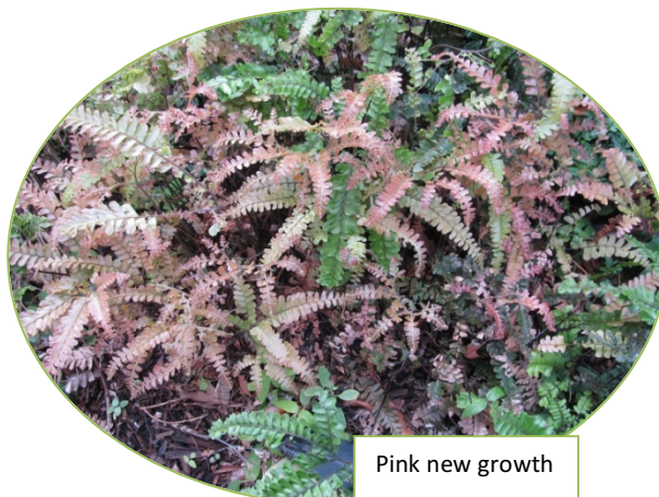
Pink new growth