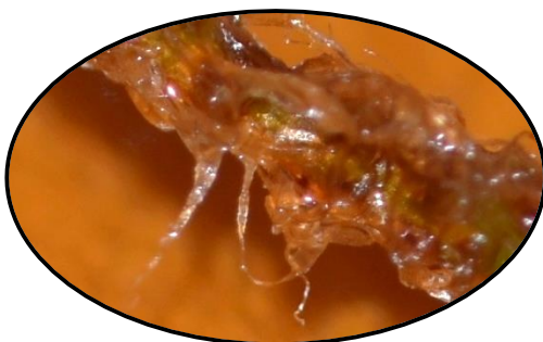
Rhizome scale with entire margin and tapering to a hair-like apex